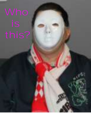
Who is this?