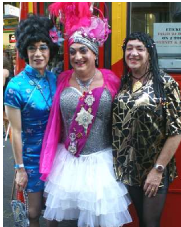
Suzie Wong, Dame Dolly & Cleopatra