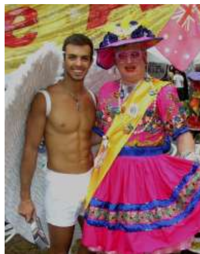
With one of the gorgeous ACON Angels Oh my God!