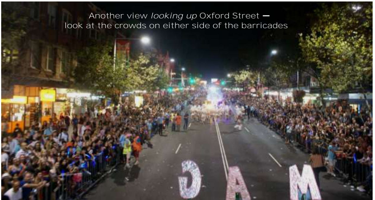
Another view looking up Oxford Street — look at the crowds on either side of the barricades