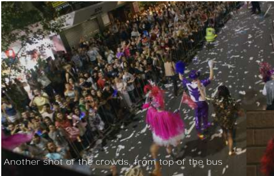
Another shot of the crowds, from top of the bus