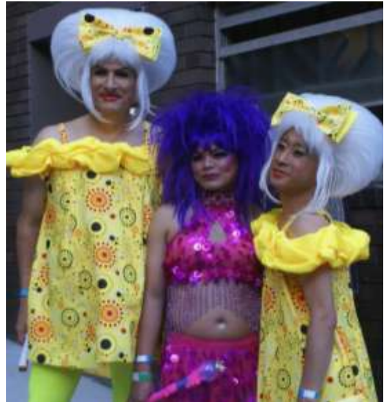
The Yellow Beryls with Chai in purple