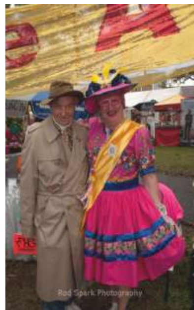
Steve and Dame Dolly at Fair Day