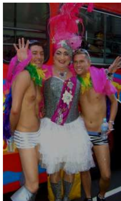
With two cuties before the Parade 4