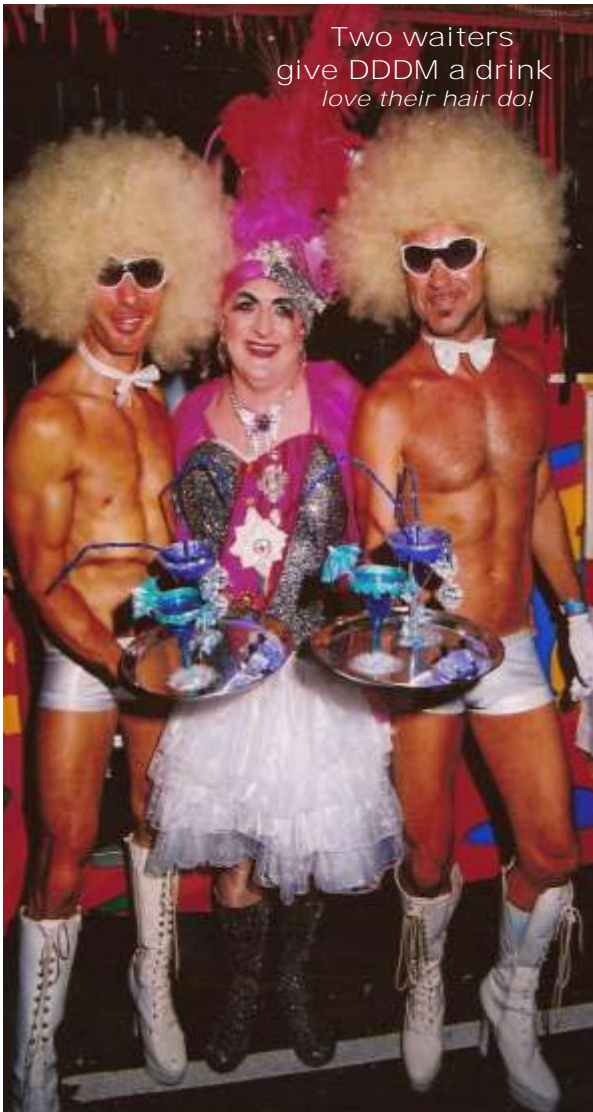
Two waiters give DDDM a drink love their hair do!